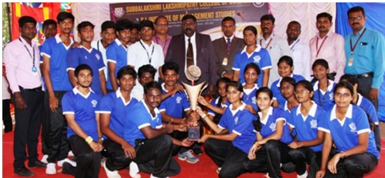
The “Challengers” with their Championship Trophy