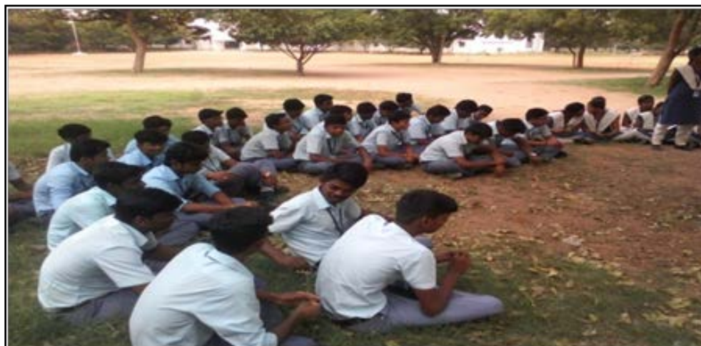
Students of I-Year (CS & SS) and 2nd year (CS & IT) students at the Class Committee Meeting