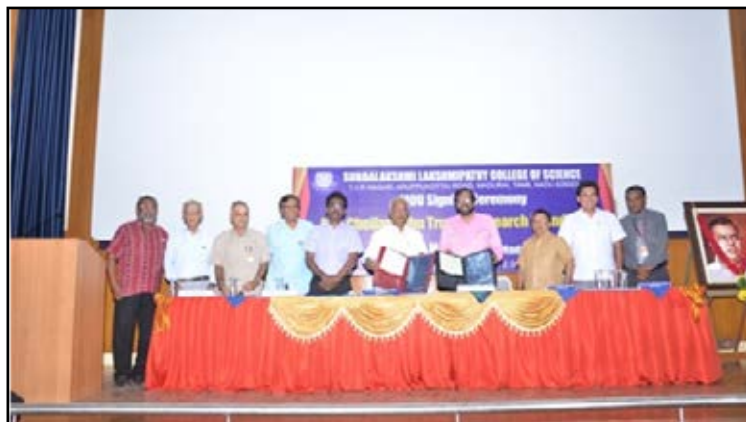
MoU Signing and Student Support Center Inauguration Teacher's Day Celebration