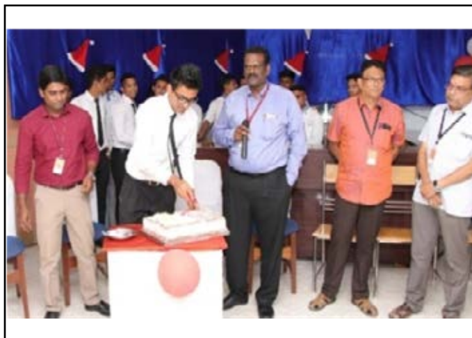
A Second Year Student Cutting the cake during the New Year Celebration.