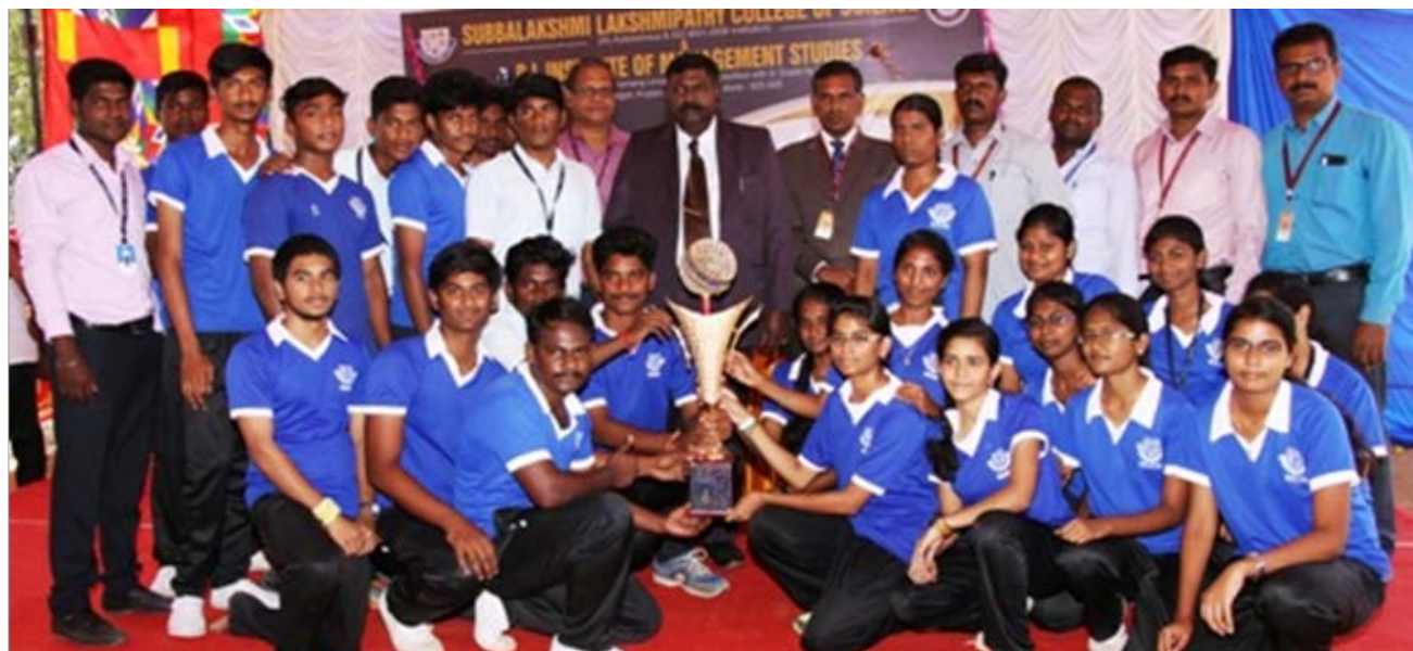
The “Challengers” with their Championship Trophy