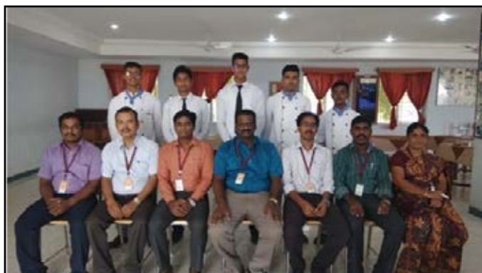
Office Bearers of the Association Cell along with their Faculty Members.