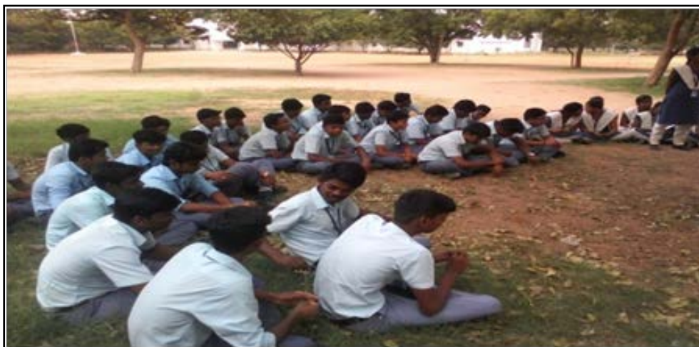
Students of I-Year (CS & SS) and 2nd year (CS & IT) students at the Class Committee Meeting