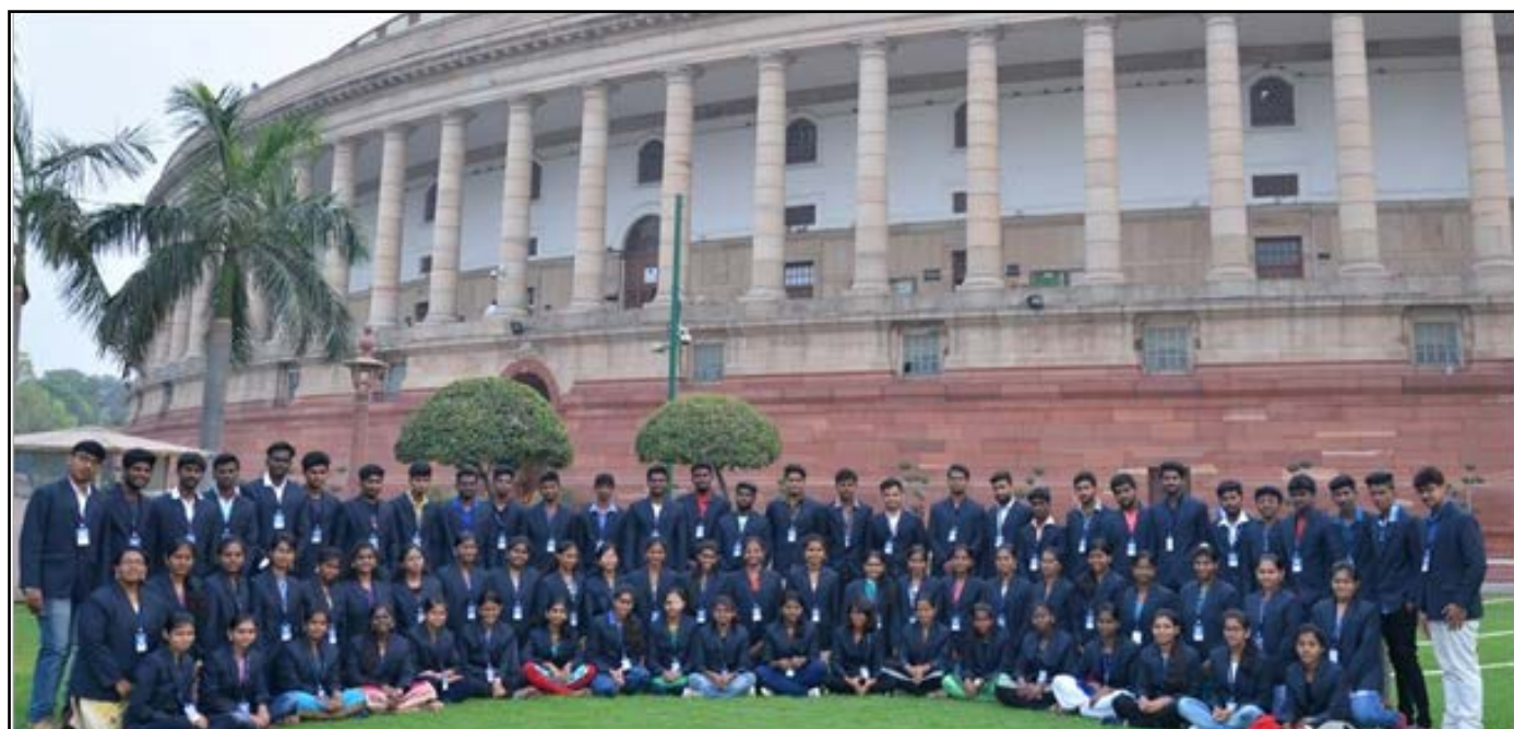
RL Institutes of Management Studies (RLIMS)