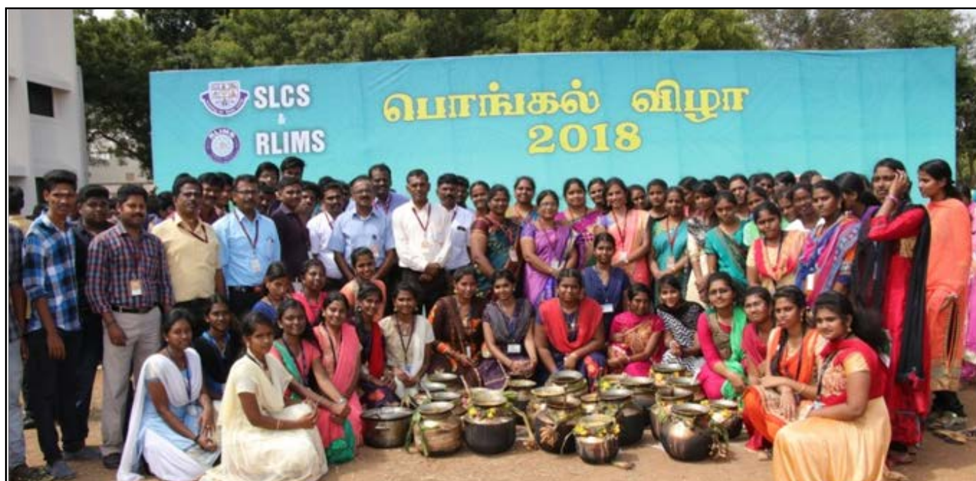
Students of SLCS & RLIMS with their Sweet Pongal preparation during the Pongal Celebrations

Thai Pongal is a harvest festival dedicated to the Sun God and one of the most important festivals for the Tamils. It is a four-day festival which according to the Tamil calendar is usually celebrated from January 14 to January 17.