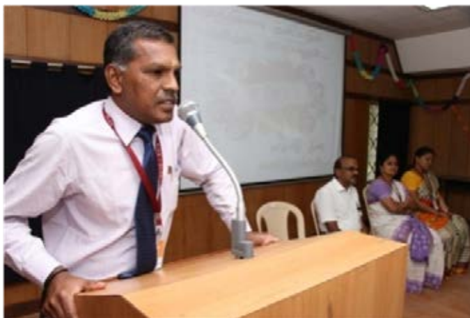
The Principal giving his special address on the occasion of International Women's Day.