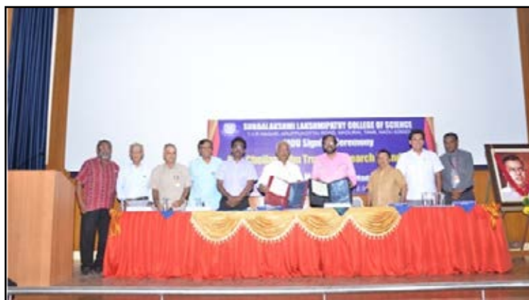
MoU Signing and Student Support Center Inauguration Teacher's Day Celebration