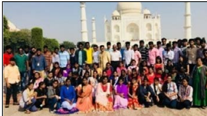
Our Students posing before the imposing Taj Mahal