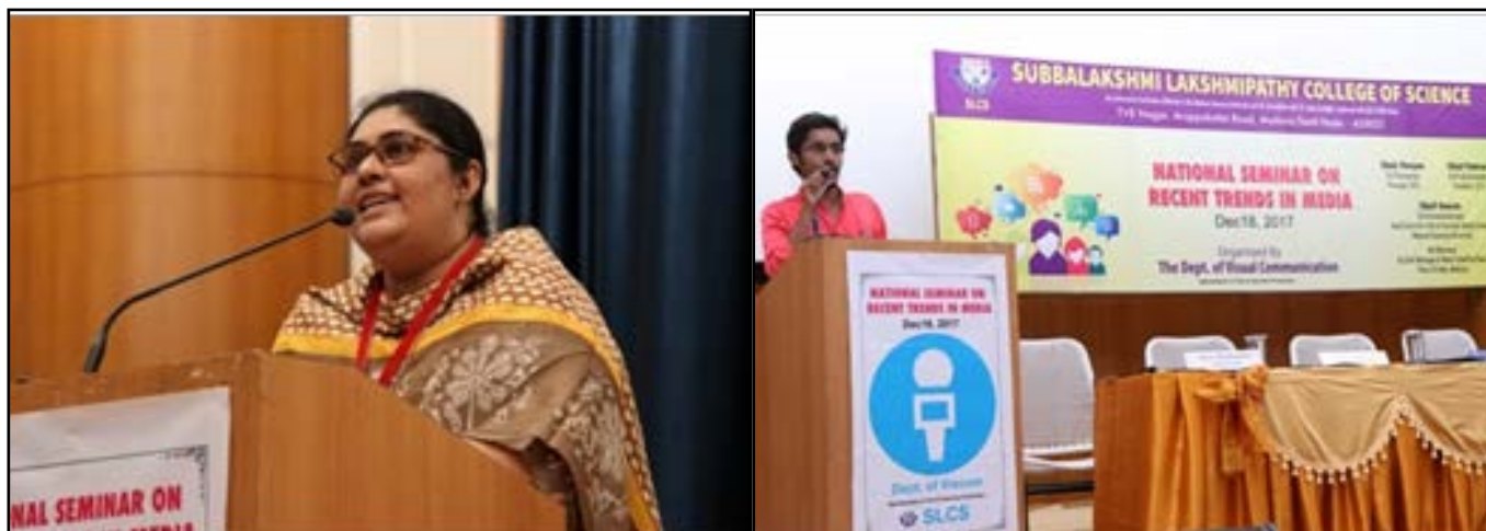
Presentations by the Participants