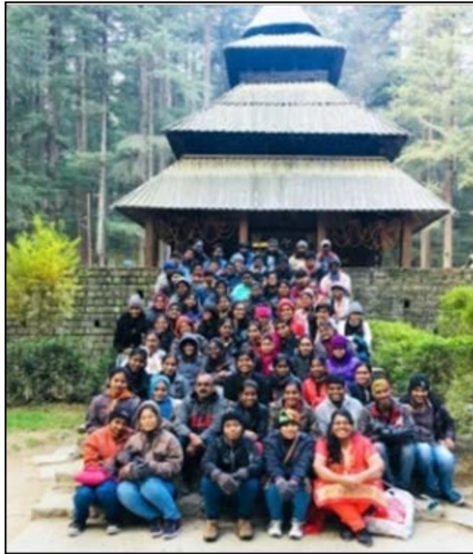
Spiritually in bliss at the Hadimba Temple