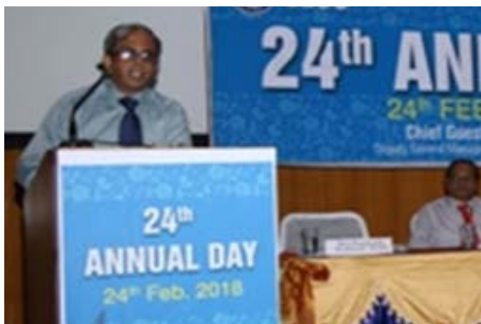
24th Annual Day of SLCS & RLIMS