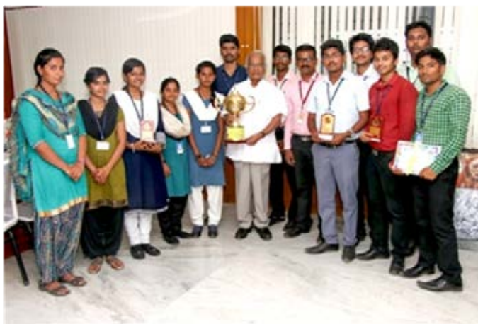
The Honorable President, congratulating the student achievers of Viscom Department