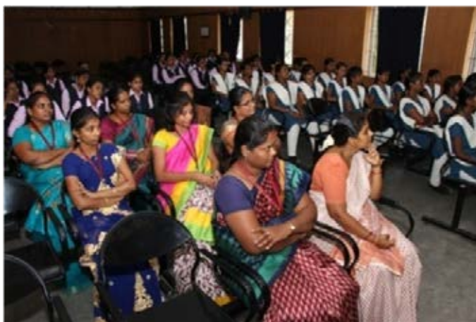
The faculty members and the students rapt in attention