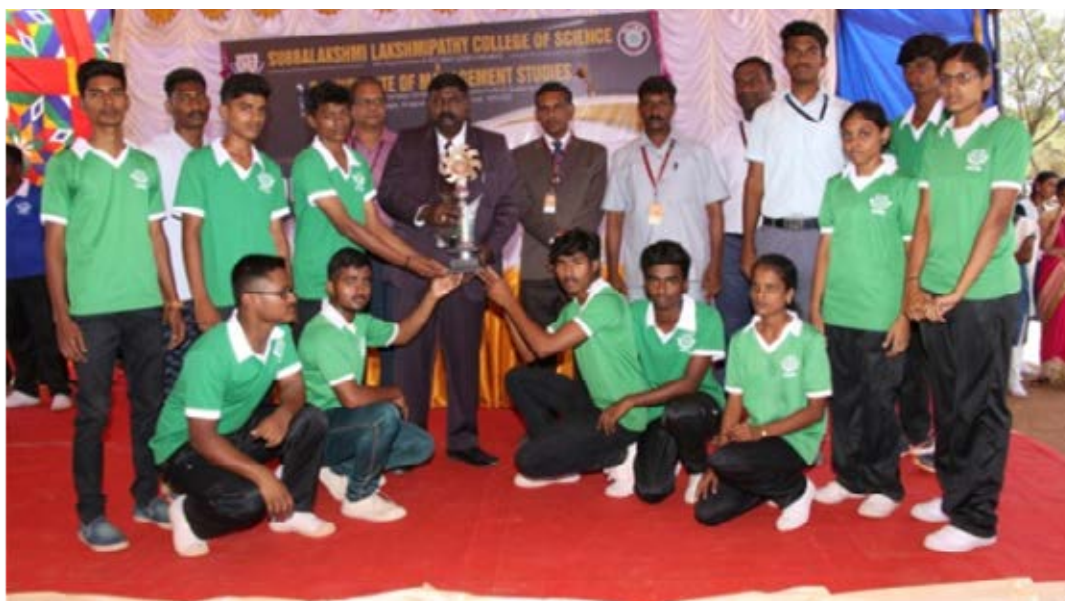
The “Rockers” with their Runner-up Trophy