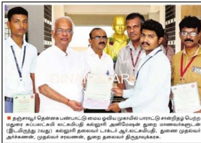
Our Honorable President honoring the achievers