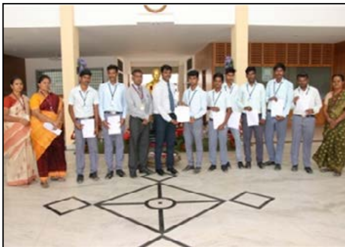
The Principal, the HoDs, a member from Eureka Forbes along with the recruited students.

As a premier institute of Madurai, SLCS continues to enjoy the immense confidence of the recruiters. An example of this was the recruitment drive conducted by Eureka Forbes at the campus for the third year students of Commerce, Computer Science & IT on 09-01-2018. Officers of Eureka Forbes conducted the interview. Around 25 students participated in the recruitment. The recruitment process consisted of Group Discussion, and Personal Interview. The recruiters were happy and satisfied with the performance of the students. Four students from Commerce, four from Computer Science and three from IT were recruited and were congratulated by the management and department.