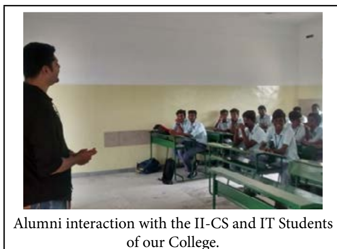
Alumni interaction with the II-CS and IT Students of our College.