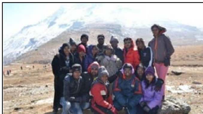
Chilling out at Manali